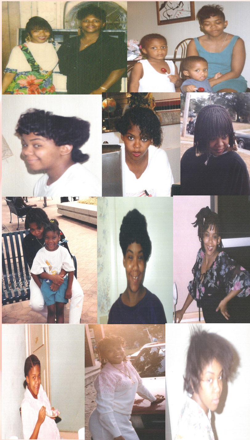
Forever in our Hearts