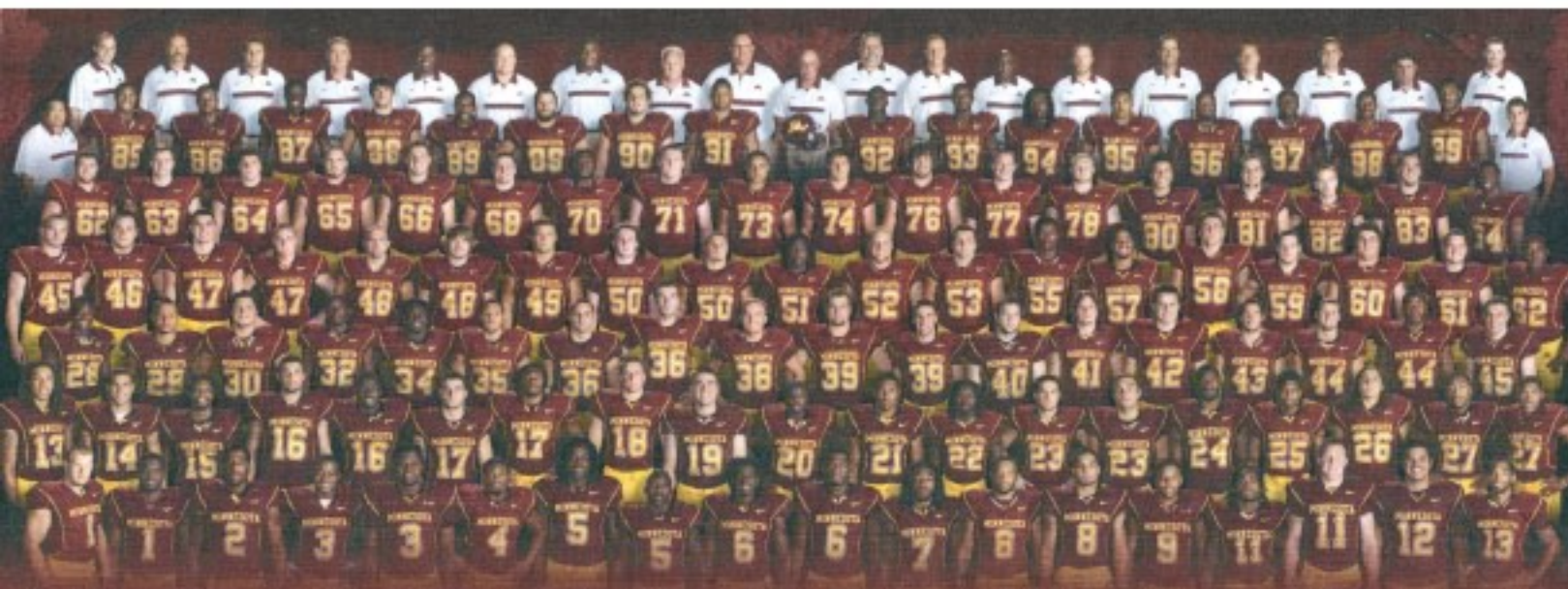
CONGRATULATIONS GRADUATES & THANKS FOR BEING GOLDEN GOPHERS