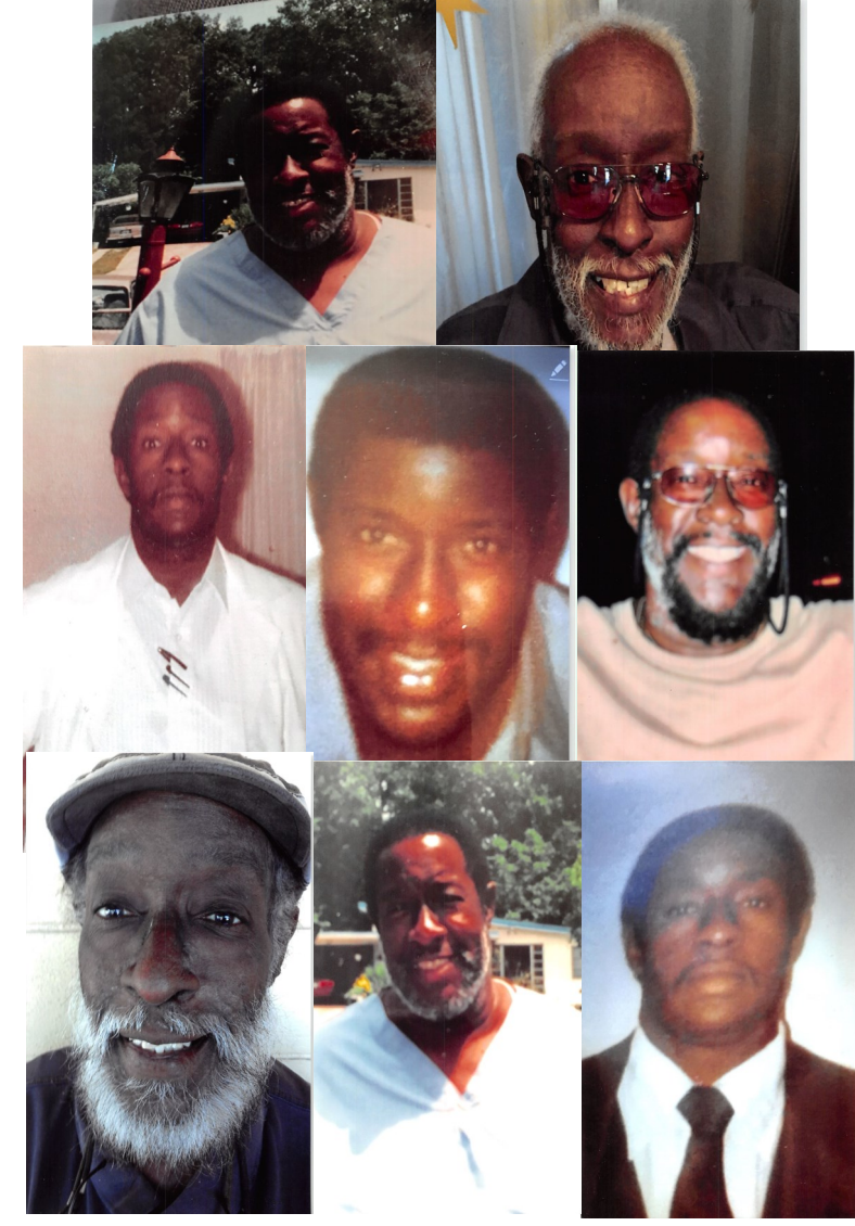
No Matter The Reasons, We Did All That Love Could Do. Just Like A Fading Sunset,