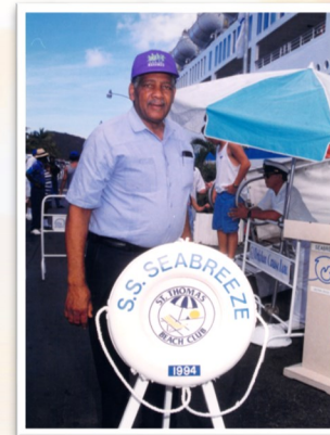
Forever In Our Hearts