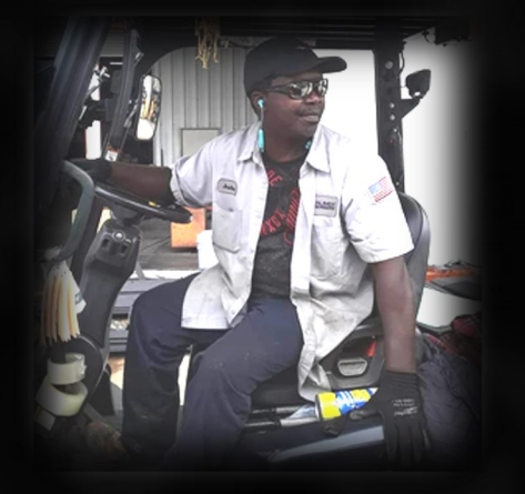
Family Members and Friends

"As long as the sun shines there's always a way to follow the light. You will be missed but never forgotten"