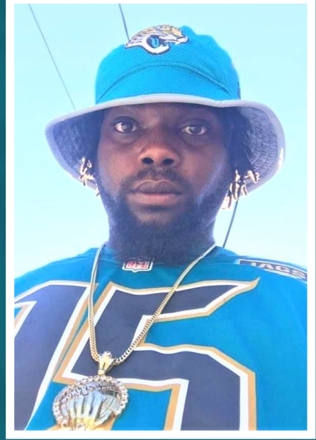
Qunset November 21, 2020