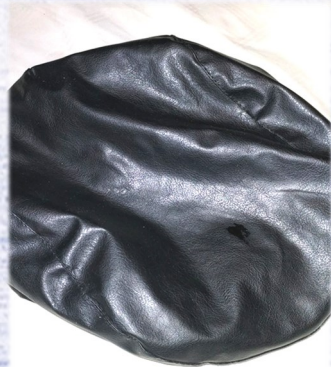
Dad's Favorite Hat